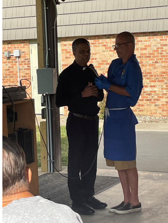
Fr. Bosco offered an opening prayer and a nice reflection on grief for those in attendance.