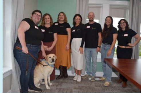
CACSCMI Jackson office staff