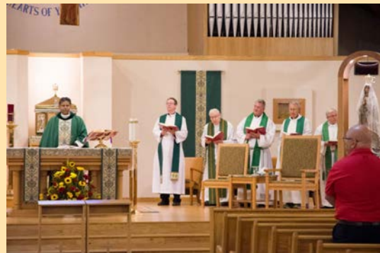
The celebration of Mass together is always a meaningful way to begin our evening together.