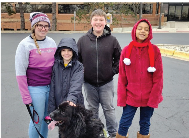
Operation Good Cheer