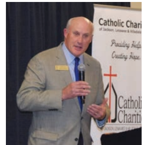
Faith in Action Fundraising Event