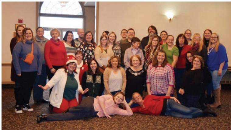
Catholic Charities Staff