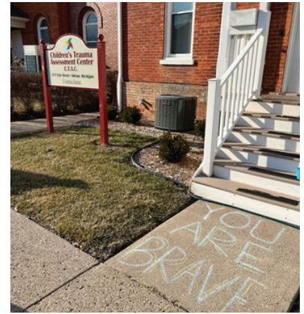
Children's Trauma Assessment Center