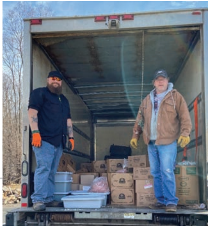
St. Patrick's Day Box Lunch Event

Catholic Charities staff thanks our donors, volunteers, and supporters. We could not do all we do without the help of our community.