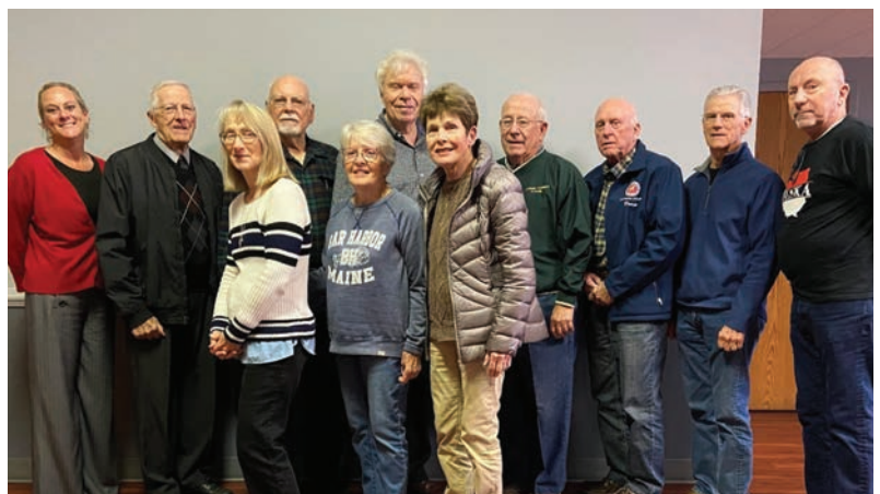
Senior Transportation Program