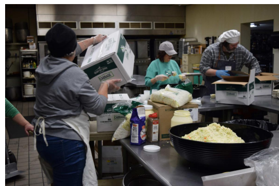
Coleslaw is handmade and delicious.