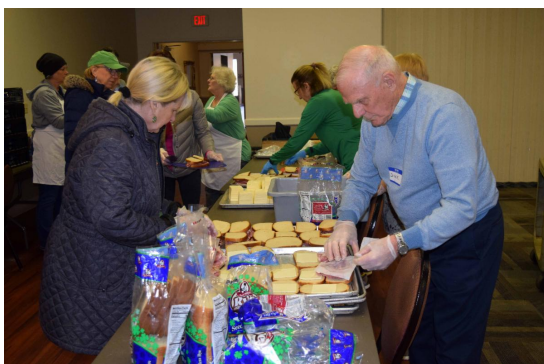
Each sandwich is carefully crafted and

Anyone who has seen our St. Patrick's Day box lunch project in action knows that we couldn't do it without the amazing support of our volunteers. We cannot fully express our gratitude for all you do to make this event a success. You are a blessing to our agency and our community!