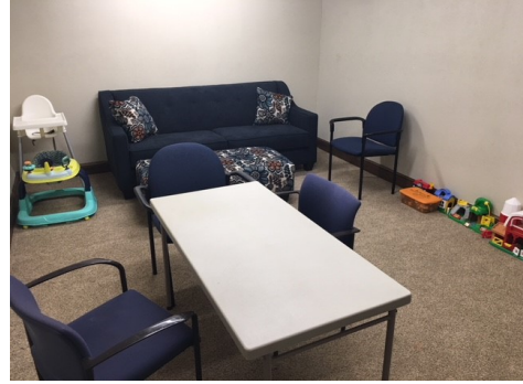
Family visitation room