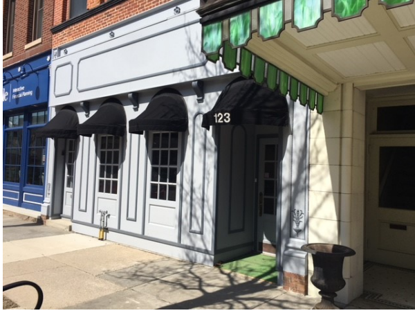
New location of our Foster Care & Adoption Services Program in Lenawee County