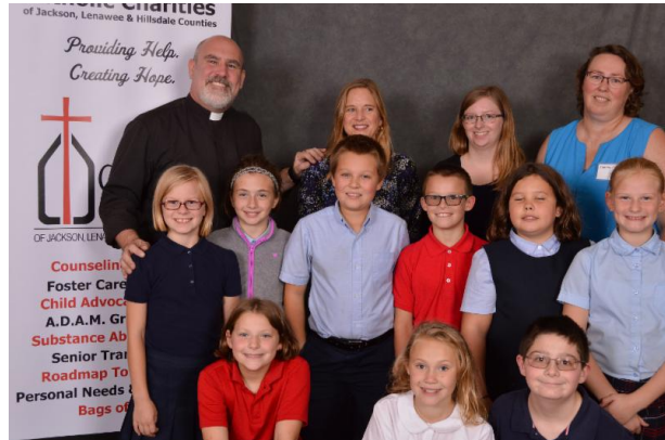
The 5th & 6th Grade class from Sacred Heart School in Hudson, MI came to lend a hand at our event.